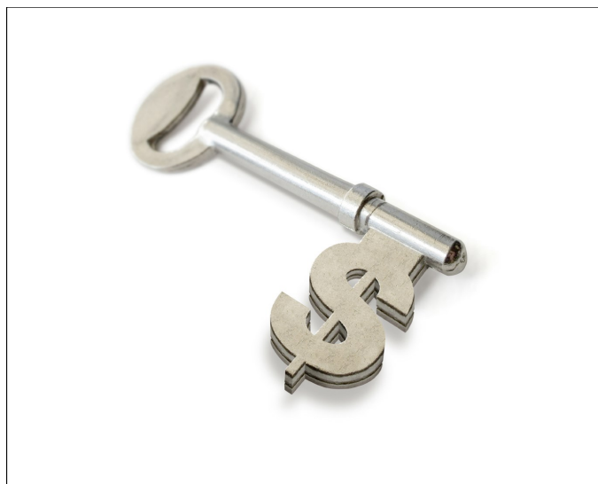
Dedication and a little hard work will pay off if you don't give up.

Once you have two or three letters of recommendation the rest of the application will be simple and you will feel confident in applying for all the scholarships you can.